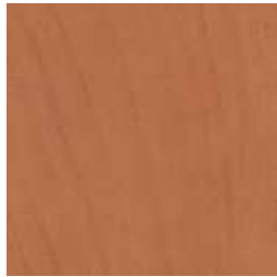
pear wood – 1538