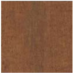
copper wood – 411