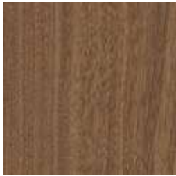
Parliament walnut- 305